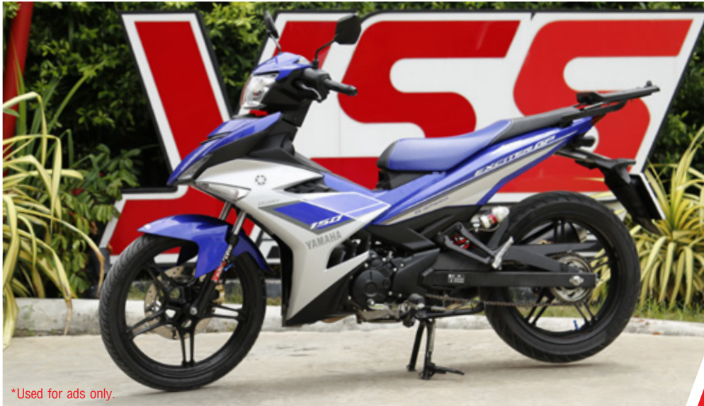
*Used for ads only.

THIS SHOCK ABSORBER DEVELOPED FOR THOSE WHO WANT A SUPERIOR PERFORMANCE WITH SPORT STYLING. PRODUCED BY ALUMINUM FORGING TO MAKE A STRONG AND MODERN DESIGN. TOGETHER WITH OPTIONAL REBOUND ADJUSTMENT, AND SPRING PRELOAD.