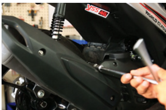
5. REMOVE THE EXHAUST BY USING THE SOCKET NO.14