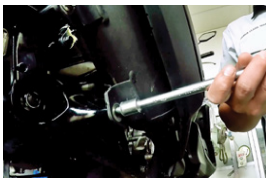
6. REMOVE ANOTER BOLTS