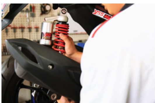
9. INSTALL THE SHOCK ABSORBER