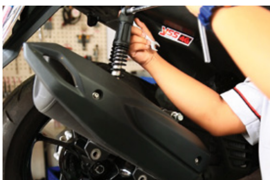
7. REMOVE THE UPPER BOLTS BY USING THE SOCKET NO.14 AND LOOSEN LOCK BY THE WRENCH NO.12